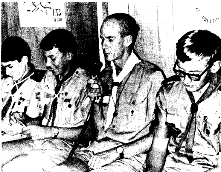
AUSTRALIAN BOY SCOUTS at the ATS ground station at Cooby Creek near Toowoomba, Australia, talk with Scouts at Goddard. The connection was made by the ATS-1 satellite and included two-way voice communication and one-way television contact from Cooby Creek to Maryland.