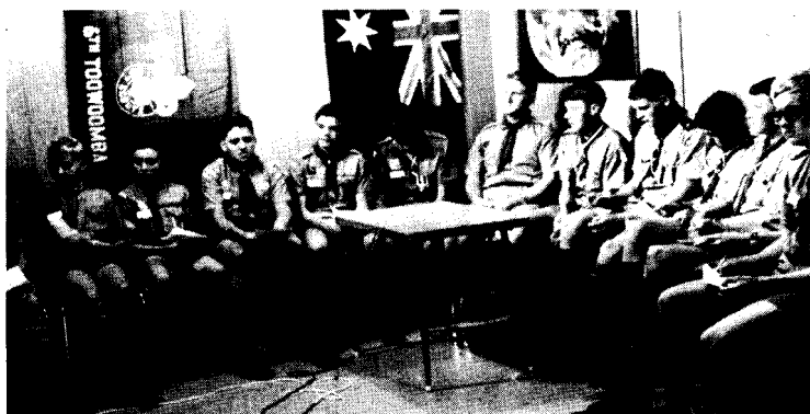
WAITING for the call, Australian Scouts sit up past 1:00 a.m. Sunday May 14 (Australian time). At Goddard, the conversation, which lasted more than an hour, began at 11 a.m. during Open House May 13.